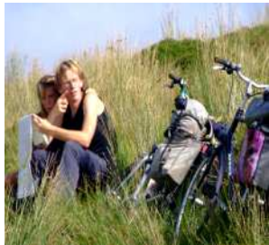
Explore more of Ireland with Wolfhound on our comfy bikes .