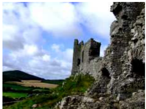
villages and all in the company of your award-winning 100% Irish 'Wolfhound' Guide.

You'll overnight in superb B+B's in quaint villages with old pubs and traditional Irish music. You'll hear myths, legends and music and you'll meet lots of friendly locals.